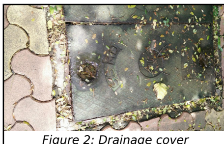
Figure 2: Drainage cover