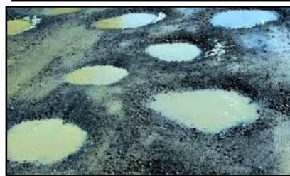
Figure 3: Puddles