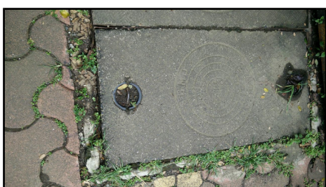
Figure 1: Drainage cover

Q7. How will you collect a dry soil sample and a wet soil sample?