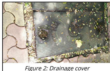
Figure 2: Drainage cover