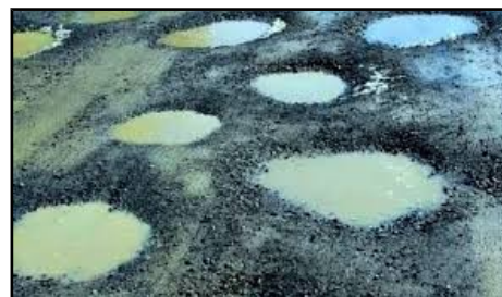
Figure 3: Puddles