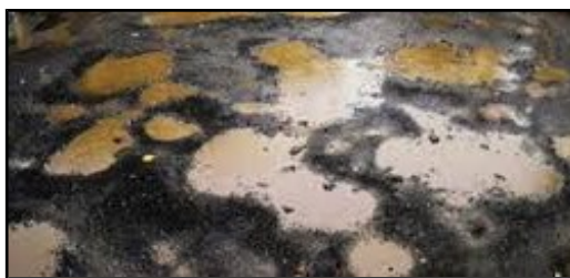
Figure 4: Puddles