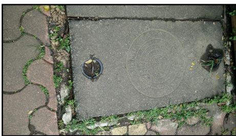
Figure 1: Drainage cover

Q7. How will you collect a dry soil sample and a wet soil sample?