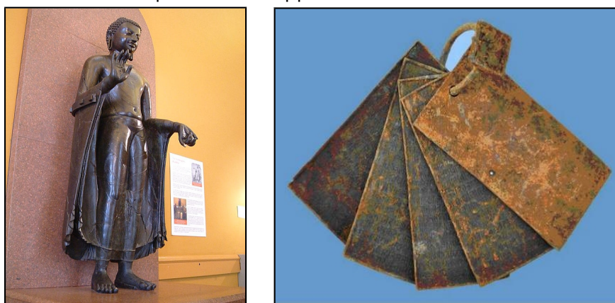
Image 2: Statue of Buddha discovered in Sultanganj, Bihar (left); Copper plates of Kalachuri dynasty (right)

Today copper finds its uses in telecommunication, electrical wiring, transport, utensils, construction, etc. In our homes, copper objects are used as wires, utensils for storing water and for eating, etc. However, due to a particular problem with copper, its use has been decreasing in our lives. This unit relates to the problem of copper that has caused the decline in use.