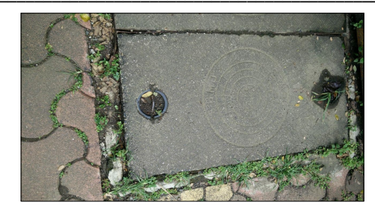
Figure 2: Drainage cover