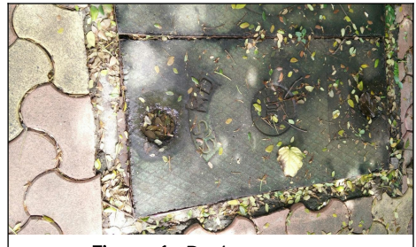
Figure 1: Drainage cover

Q7. How will you collect a dry soil sample and a wet soil sample?