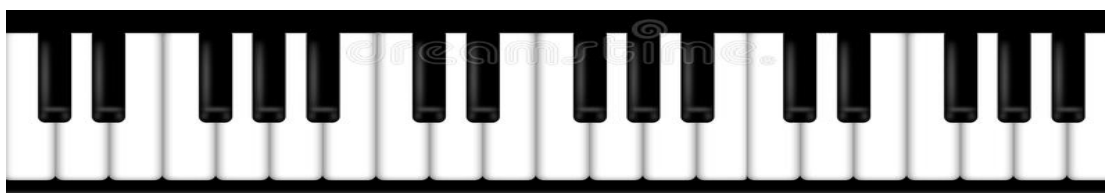
Illustration 1: Arrangement of black and white keys in a harmonium.

Teacher will play different keys on Harmonium and you have to note frequency of those keys in the table below. For convenience, let us agree to a convention. On the harmonium, you will see a pair of black keys and then a set of three black keys. The white key just before the black pair (first key in the figure) will be called White 1 (W1).